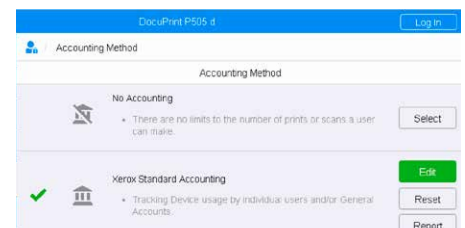
Xerox® Standard Accounting