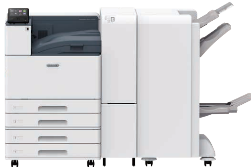
With 2 Tray Module and C3 Finisher with Booklet Maker and Folder Unit CD1

Staple capacity of up to 50 / 65 sheets* / Punch* / Saddle Staple / Single Fold