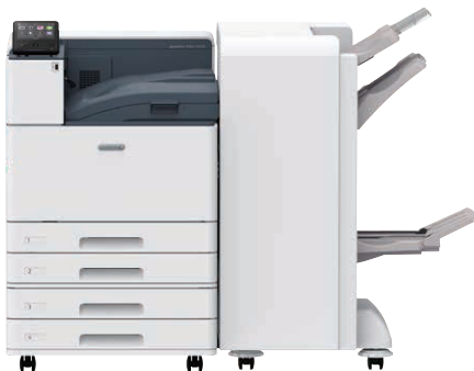
With 2 Tray Module and C3 Finisher with Booklet Maker

Staple capacity of up to 50 / 65 sheets* / Punch* / Saddle Staple / Single Fold