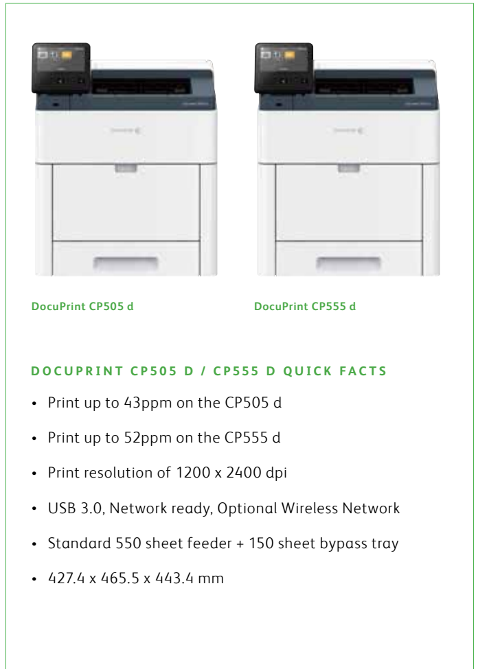
DocuPrint CP505 d

The Fuji Xerox DocuPrint CP505 d and CP555 d are packed with features, delivering higher productivity and better operations. All wrapped up in a small footprint, that helps save valuable office space.