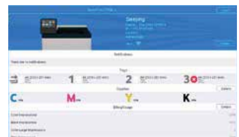
CentreWare Internet Services

Xerox® Standard Accounting also gives you a simple yet effective way to enhance network security, by limiting access and tracking use of your printer.