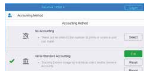
Xerox® Standard Accounting