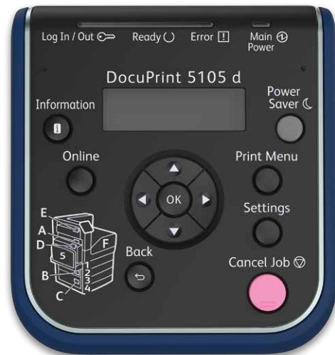
The simplified control panel of the DocuPrint 5105 d makes on-printer operations quick and easy.

The DocuPrint 5105 d incorporates a paper security function that allows the user to Water Mark printed documents with a copy restriction code and a Universally Unique Identifier (UUID), that restricts the document from being copied or scanned, and can also identify the print machine that was used to print the document.